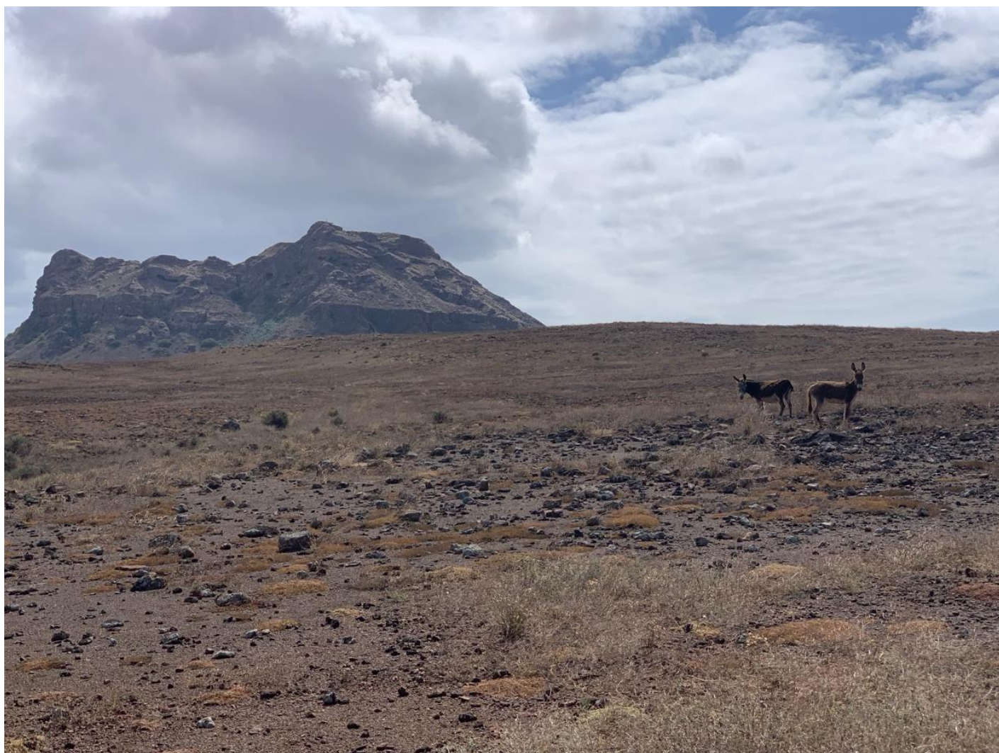
Figure 3. The natural habitat of Cucumis melo subsp. meloides in Boavista, Cape Verde, with feral donkeys ( Equus asinus ) that eat the fruits and disperse the seeds.