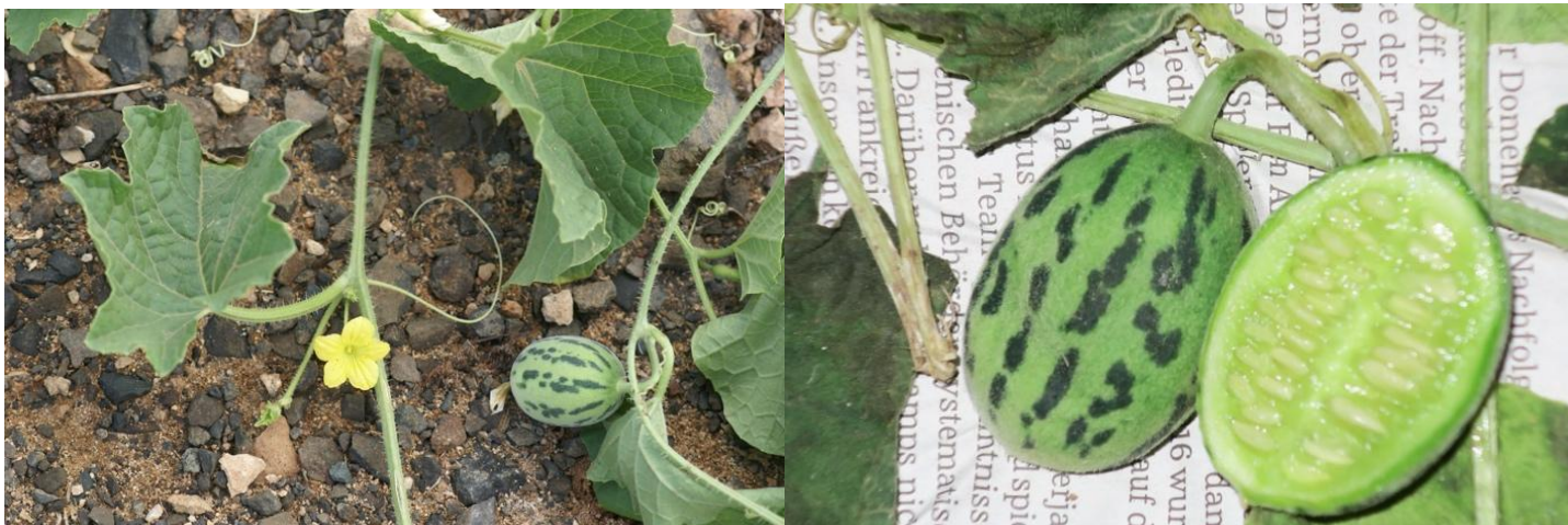
Figure 2. Cucumis melo subsp. meloides shoot with male flower and fruit (left) and longitudinally cut fruit (3.5 cm long) showing the large number of small cream-white seeds (right); Sal, Cape Verde, Oct. 2015.